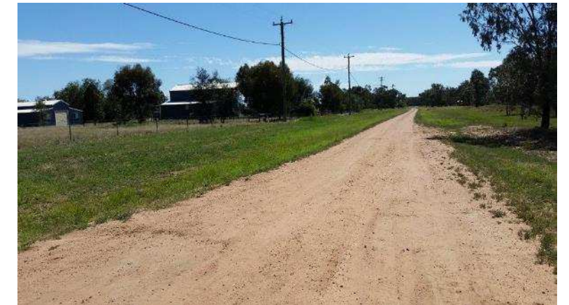
Wonbobbie St (seal to Calga St, drainage, possible street trees)