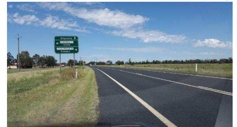
Navigation Sign (Oxley Highway west)