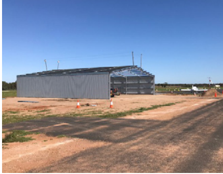
First airport hangar under construction by WRL Engineering.