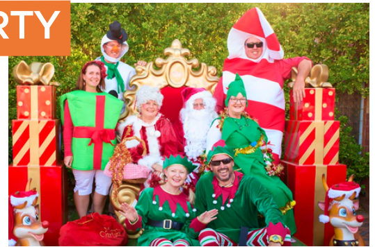
← PHOTOGRAPHER WANTED!

Find out more about the festivities on Council's website .