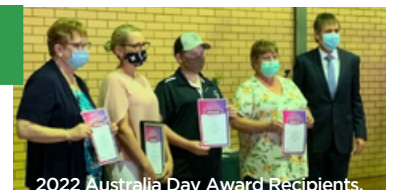
2022 Australia Day Award Recipients.

Find out more or download nomination forms on Council's website .