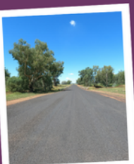
Roads Infrastructure Manager